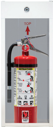
SHOWN WITH SF-ABC340. FIRE EXTINGUISHERS ARE SOLD SEPARATELY