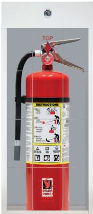
SHOWN WITH SF-ABC680. FIRE EXTINGUISHERS ARE SOLD SEPARATELY