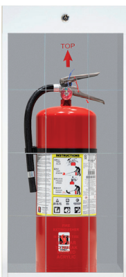
SHOWN WITH SF-ABC1020. FIRE EXTINGUISHERS ARE SOLD SEPARATELY